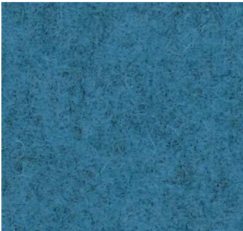
ICE BLUE (MFIC)