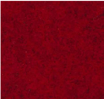
CHILLI RED (MF CR)