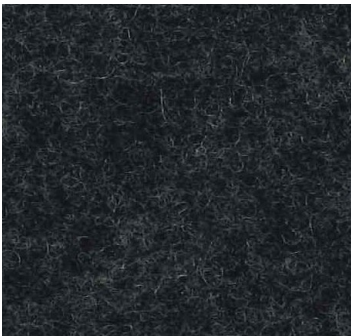
CHARCOAL GREY (MFCL)