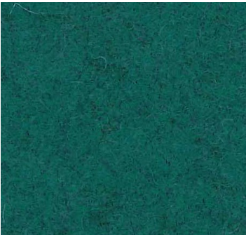
EMERALD GREEN (MFEM)