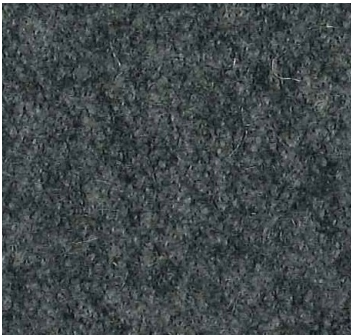
STONE GREY (MFST)