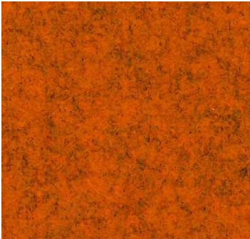
SUNSET ORANGE (MFSO)