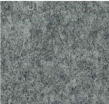
ASH GREY (MFAS)