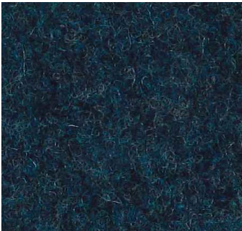
DEEP BLUE (MFDB)