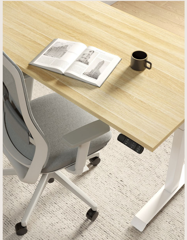
Image (Right) Haven Electric SSD Featuring a sleek white frame paired with an Atlantic Oak top, the Haven SSD desk combines style and functionality.

Whether used in commercial fit-outs or curated home offices, Haven blends expressive form with enduring strength.