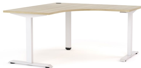
HAVEN FIXED WORKSTATION (WS)