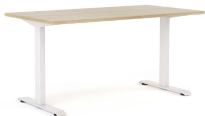
HAVEN FIXED SINGLE SIDED DESK (SSD)